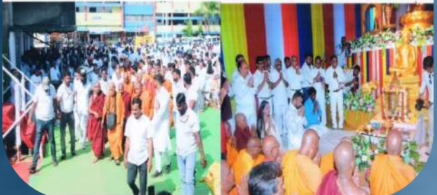
Astikalash Rally & Buddhist monk taking Trisharan